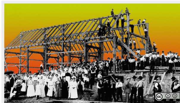
The open source way is similar to a barnraising.

If you have any questions that our documentation doesn't answer, please ask on the project mailing list .